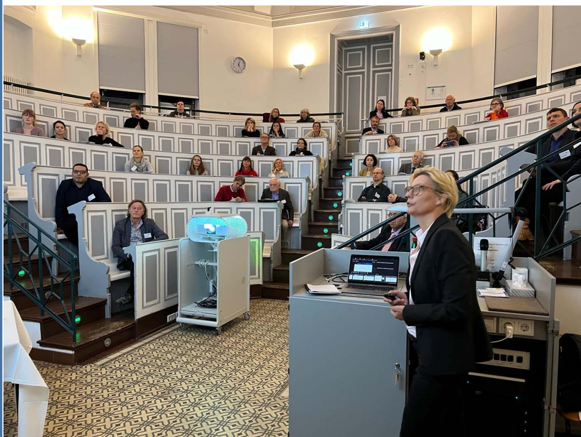
Fig. 1: The lecture hall, a historical anatomic theatre.